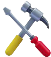
Installation Kit Included